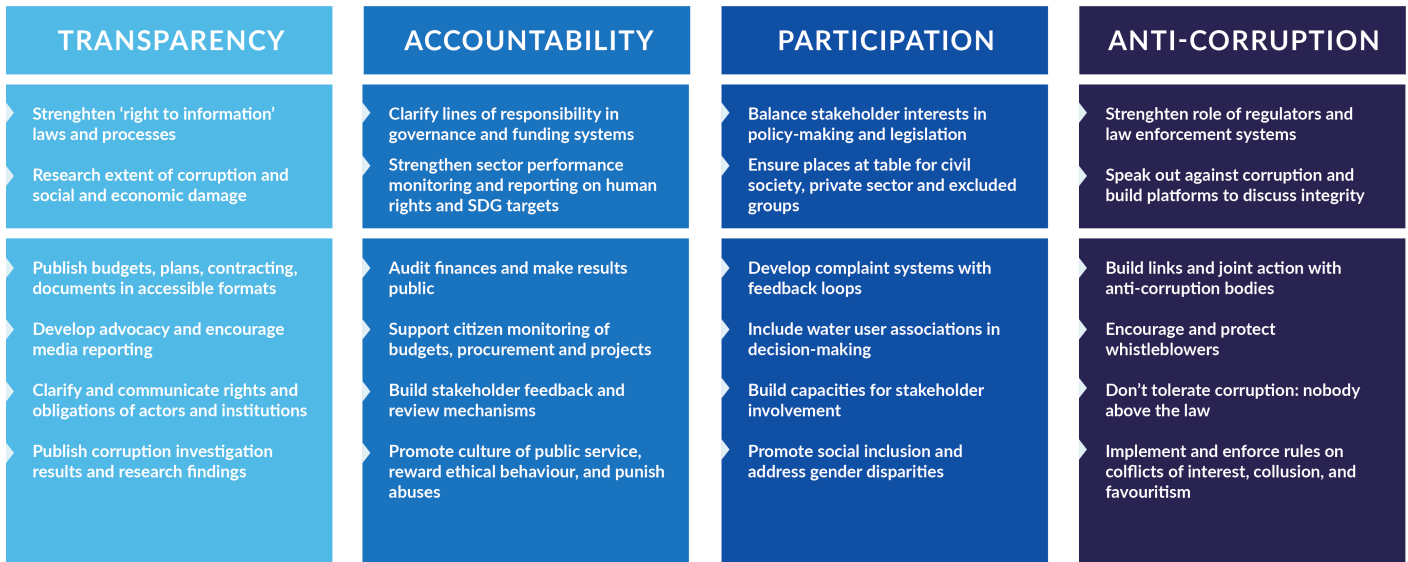
Figure 1. The Integrity Wall

integrity enablers that lead to reduced instances of corruption, promoting respect for the rule of law, triggering responsiveness, and ultimately leading to improved services in the water sector. 59 The outcome of the analysis allows analysts, policy makers and other practitioners to check how ‘waterproof’ their actions and policies are, and to strengthen enforcement mechanisms with a clear focus on those who are affected most strongly – the poor and marginalised.